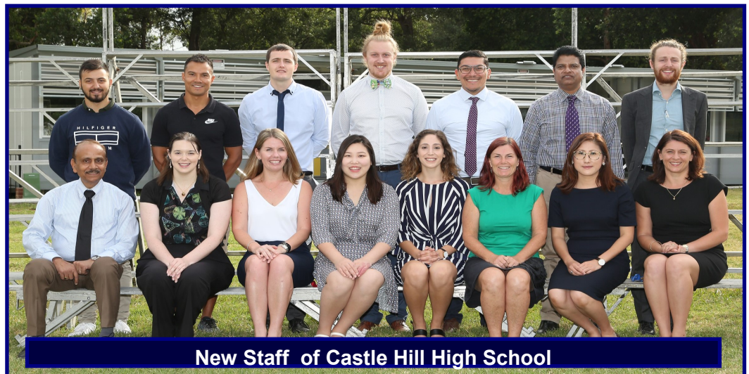
New Staff of Castle Hill High School

Here are our new members of staff, many of whom were at camp last week with Year 7. Each of them brings something different, special and extra to our culture here at Castle Hill High School and for that we are grateful.